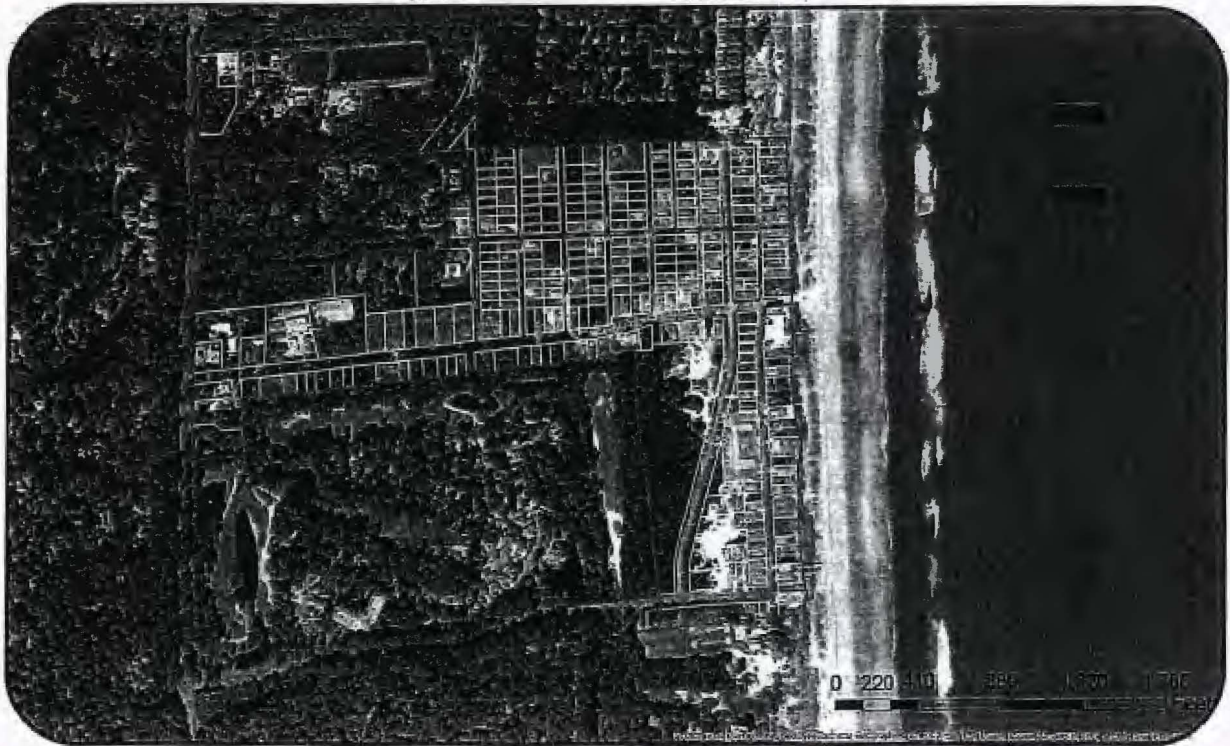
FIGURE 1: LOCATION MAP (AMERICAN BEACH)